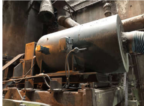
WPF -Primary Shredder Motor (1250 hp)