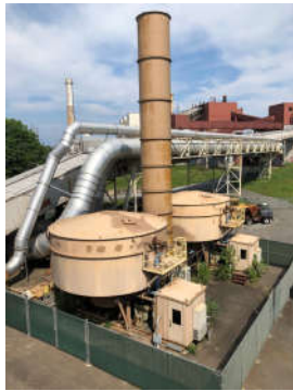
WPF – Thermal Oxidizer