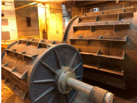
WPF - Primary and Secondary magnets