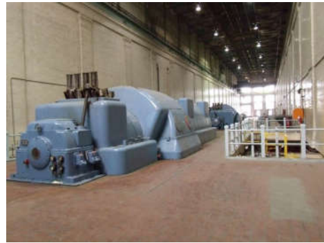
PBF - Turbines